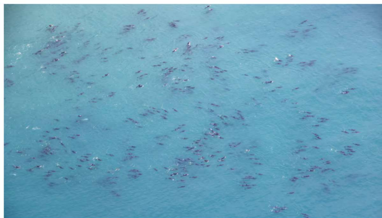
Christchurch pilot Chris Lierheimer spotted a pod of approximately 450 dolphins while flying over the Kaikōura coast.

A Christchurch pilot had the encounter of a lifetime when he flew over a pod of approximately 450 dolphins swimming off the Kaikōura coast.