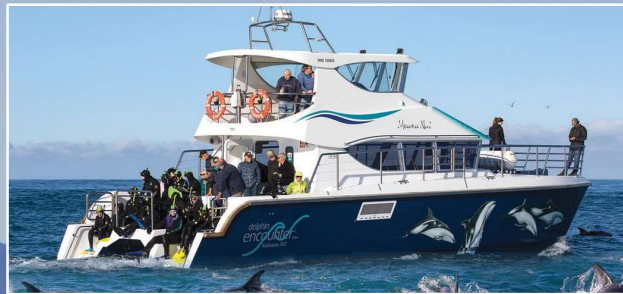
MV Moana Nui

Transport from operating base to harbour and return is included.