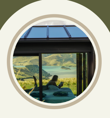
Põhue, Banks Peninsula

Hidden above a beautiful organic winery in Waipara, the subtle hues and light shifts create a golden glow on the landscape and is less than an hour drive from Christchurch.