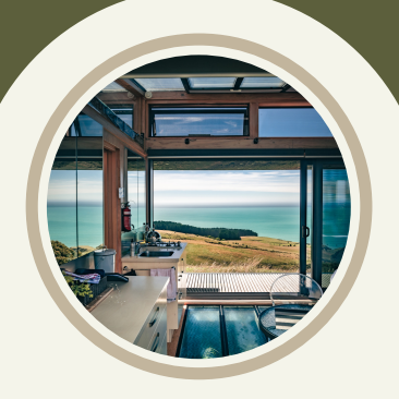
Atatū, Greta Valley

Situated in a vast landscape with sweeping and dramatic views of the Seaward Kaikōura mountain range, only 20 minutes inland from Kaikōura or 2.5 hours from Christchurch.