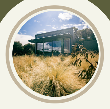
Korimako, Greta Valley

On a historic Greta Valley sheep farm, with sweeping 360-degree views of the sea, rolling hills and native forest, only 90 minutes from Christchurch.