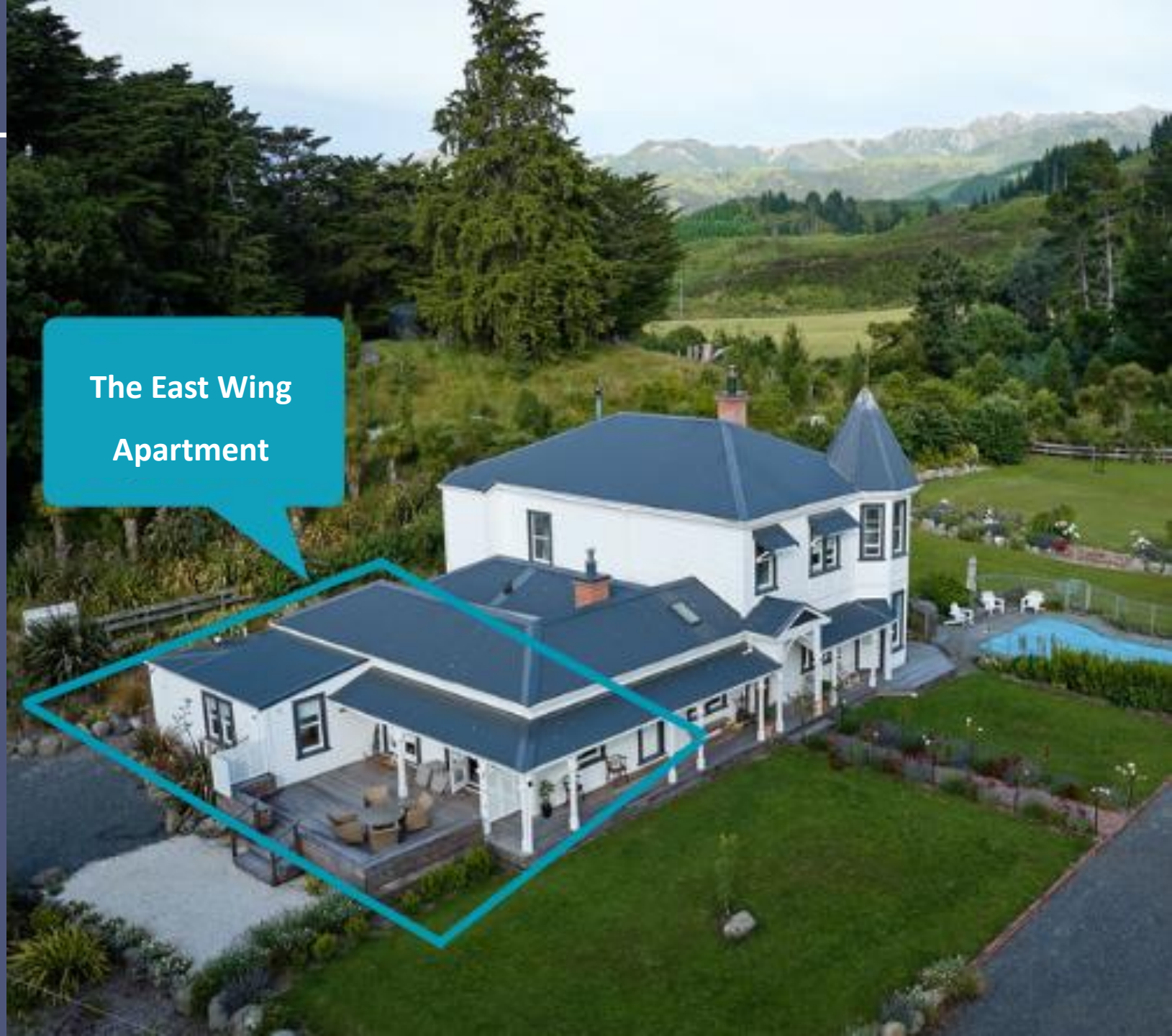
The East Wing Apartment

It is a place of tranquillity and relaxation to enjoy.