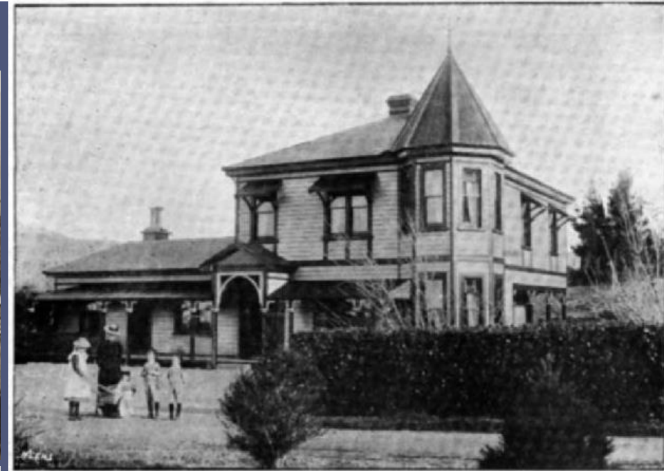
THE RESIDENCE, LYNTON DOWNS.