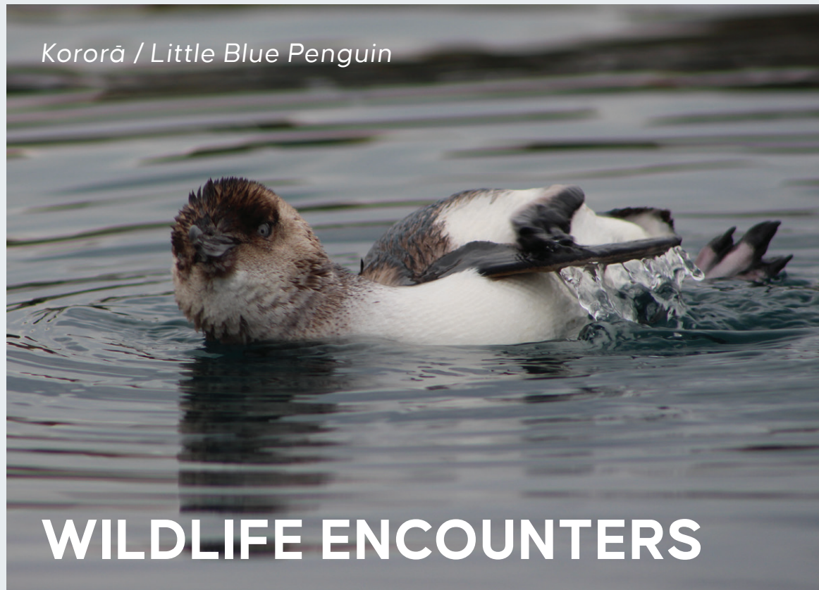
Kororā / Little Blue Penguin