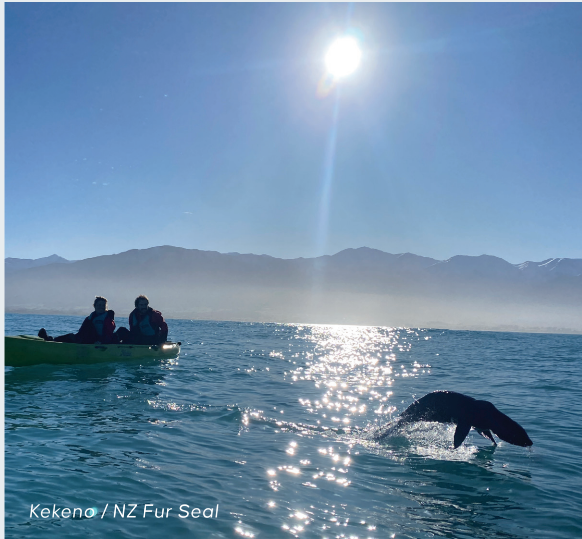
Kekeno / NZ Fur Seal