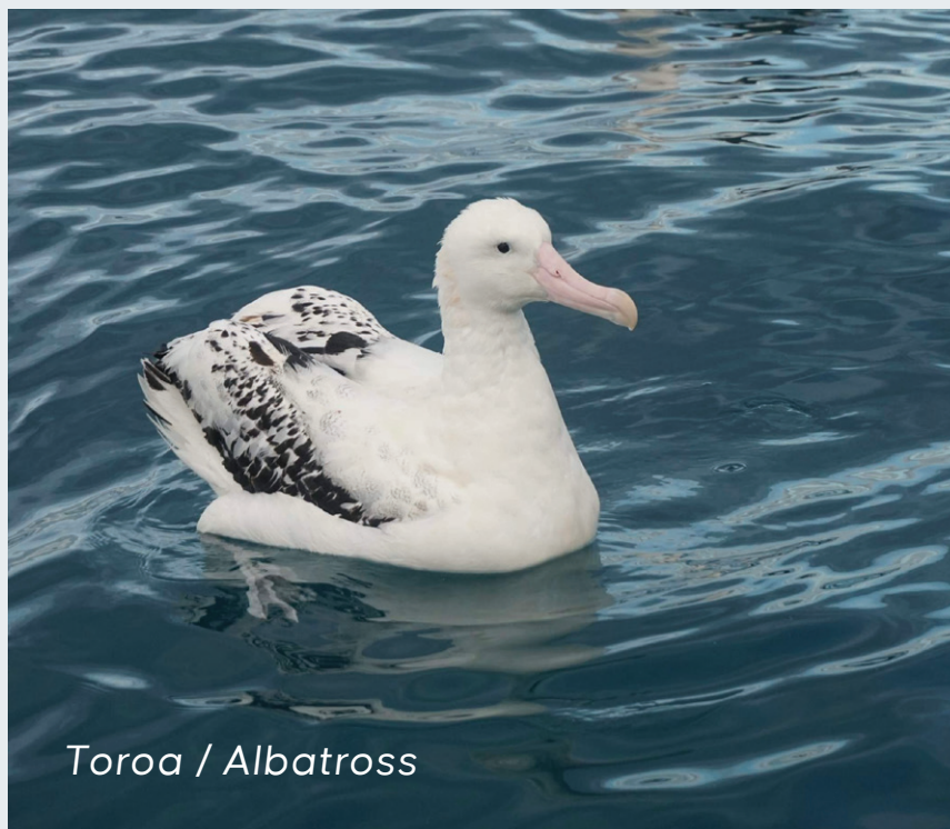
Toroa / Albatross